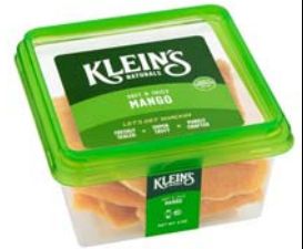
# 22110 Mango Soft & Juicy 6/6oz.