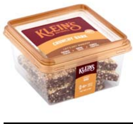
# 88208P Crunchy Bark Passover 6/6oz.