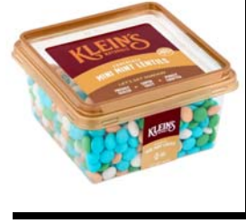
# 88223 Mini Mint Chocolate Lentils 6/