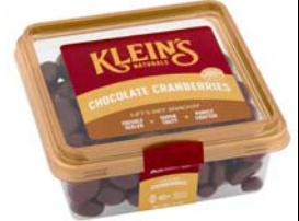
# 88001P Chocolate Cranberries Passover