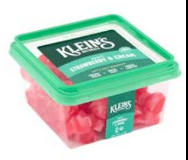
# 88307 Strawberry & Cream Drops 6/9oz