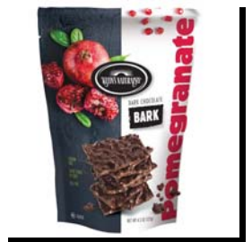
# 31993 Pomegranate Bark 6/4.5 oz PARVE