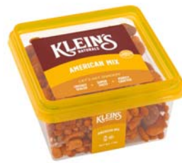
# 22880 American Mix 6/7oz.