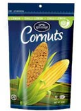
# 31822 Corn Nuts Chili Lemon 12/6 oz