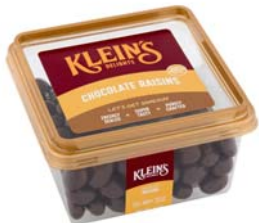
# 88002 Chocolate Raisins 6/10oz.