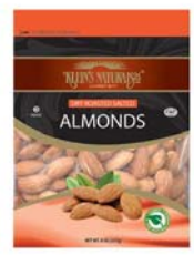
# 31810 Almonds Dry Roasted Salted 12/