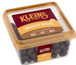
# 88002P Chocolate Raisins Passover 6/1