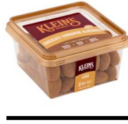
# 88211P Chocolate Cinnamon Almonds Pas