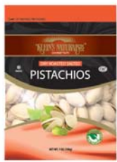
# 31806 Pistachios Dry Roasted Salted