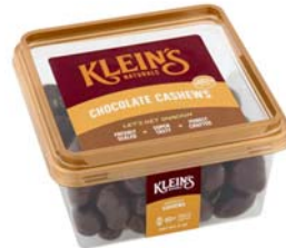
# 88006 Chocolate Cashews 6/8oz.