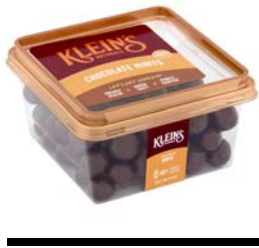
# 88210P Chocolate Mints Passover 6/9oz