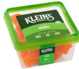
# 22109 Mango 6/6oz.