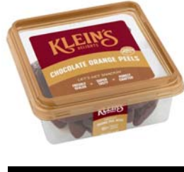
# 88206P Orange Peel. Chocolate Passove