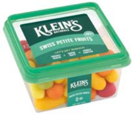
# 88321 Swiss Petite Fruits 6/9oz.