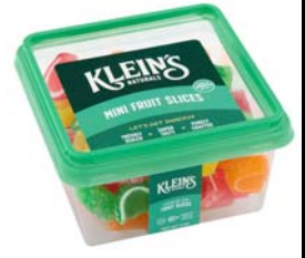
# 88314P Mini Fruit Slices Passover 6/8