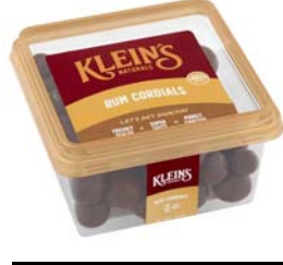
# 88209 Rum Cordials 6/10oz.