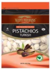
# 31805 Pistachios Roasted Salted Turk