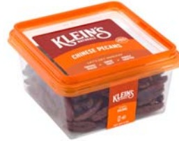
# 11804 Pecans Chinese 6/6oz.