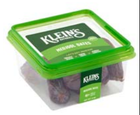
# 22106 Medjool Dates 6/8oz.