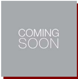
# 31986 Chocolate Orange Peel Bites 6/5 oz PARVE