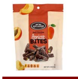
# 31988 Chocolate Apricot Bites 6/5 oz PARVE