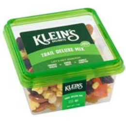
# 22700 Trail Deluxe Mix 6/7oz.