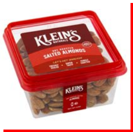
# 11122 Almonds Dry Roasted Salted 6/8