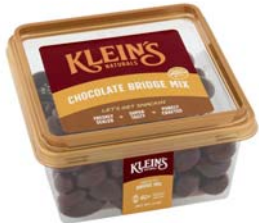
# 88004P Chocolate Bridge Mix Passover