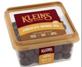
# 88004 Chocolate Bridge Mix 6/9oz.