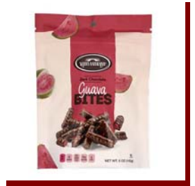
# 31989 Chocolate Guava Bites 6/5 oz PARVE