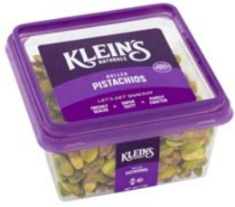
# 11200 Pistachios Hulled 6/7oz.