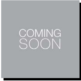
# 33806 Sunflower Seeds Roasted Salted