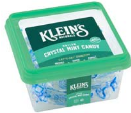
# 88323 Crystal Matlow Candy Mint 6/5oz