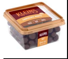
# 88210 Chocolate Mints 6/9oz.