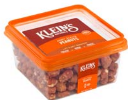
# 11405 Peanuts Honey Glazed 6/7oz.