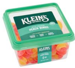
# 88306 Jelly Shaped Rings Peach 6/8oz