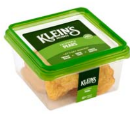
# 22112 Pears California 6/6oz.