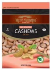
# 31812 Cashews Dry Roasted Salted 12/