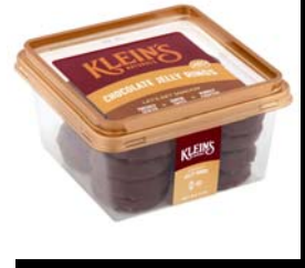
# 88207 Chocolate Jelly Rings 6/8oz.