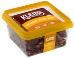
# 11514 Rosemary Mixed Nuts 6/6oz.