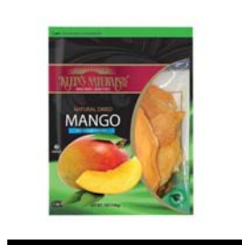
# C31942 Master Case Mango Cheeks 48/7oz PARVE