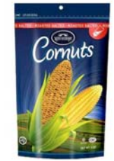
# 31820 Corn Nuts Roasted Salted 12/6