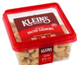
# 11302 Cashews Roasted Salted 6/7oz.