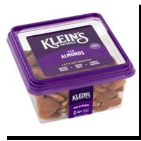
# 11100 Almonds Raw 6/8oz.