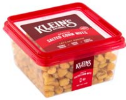
# 11520 Corn Nuts Roasted Salted 6/5oz