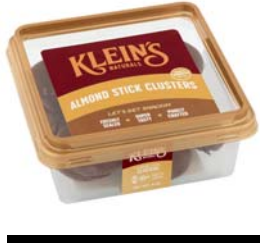
# 88205P Almond Stick Clusters Passover