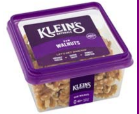
# 11600 Walnuts Raw 6/5oz.