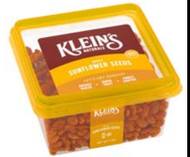
# 11513 Sunflower Seeds Hulled Spicy 6/7oz.