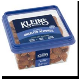
# 11101 Almonds Roasted Unsalted 6/8oz