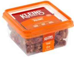
# 11803 Pecans Honey Glazed 6/5oz.