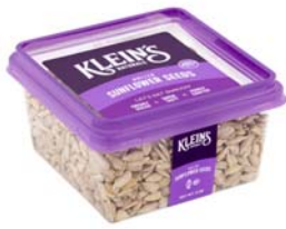
# 11740 Sunflower Seeds Hulled Raw 6/8