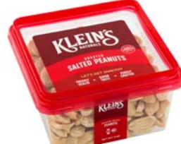
# 11402 Peanuts Roasted Salted 6/8oz.