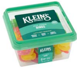
# 88302 Jelly Shaped Rings 6/8oz.