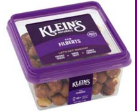
# 11900 Filberts Raw 6/7oz.