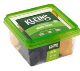
# 22208 California Mixed Fruit 6/7oz.