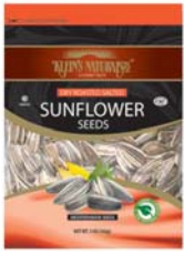
# 31801 Sunflower Seeds Dry Roasted Sa