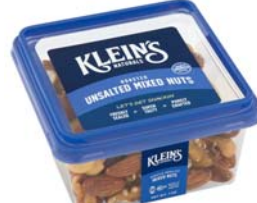
# 11501 Mixed Nuts Roasted Unsalted 6/7oz.