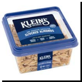
# 11123 Almonds Slivered Dry Roasted U