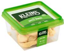
# 22107 Apple Rings 6/4oz