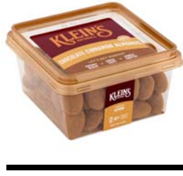
# 88211 Chocolate Cinnamon Almonds 6/9