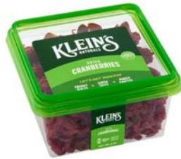
# 22108 Dried Cranberries 6/8oz.