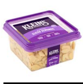
# 11124 Almonds Sliced Blanched 6/6oz.