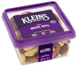
# 11507 Brazil Nuts Raw 6/8oz.