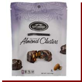
# 31990 Mini Almond Clusters 6/5 oz PARVE