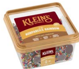
# 88200P Nonpareils Mini Rainbow Passover