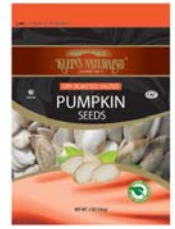
# 31804 Pumpkin Seeds Dry Roasted Salt