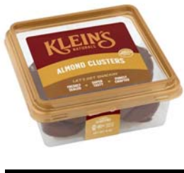
# 88204 Almond Clusters 6/6oz.