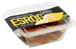
# 21900 Esrog NO RETURNS 12/4 oz