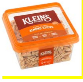
# 11106 Almonds. H/G Sticks 6/7oz.