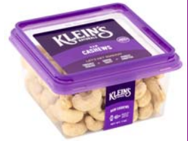
# 11300 Cashews Raw 6/7oz.