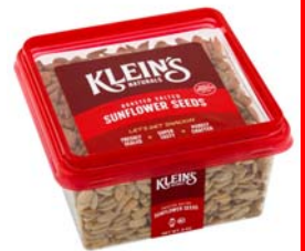
# 11742 Sunflower Seeds Hulled Roasted