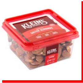
# 11102 Almonds Roasted Salted 6/8oz.