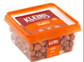
# 11403 Peanuts Honey Roasted 6/7oz.