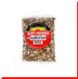
# 50852 Watermelon Seeds Roasted Salted PARVE