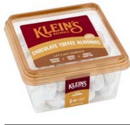
# 88213 Chocolate Toffee Almonds 6/9oz