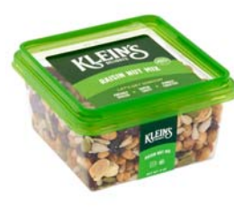
# 22600 Raisin Nut Mix 6/8oz.