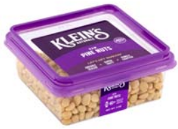
# 11510 Pine Nuts Raw 6/4oz.