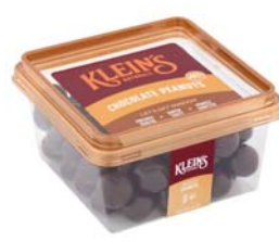
# 88003 Chocolate Peanuts 6/9oz.