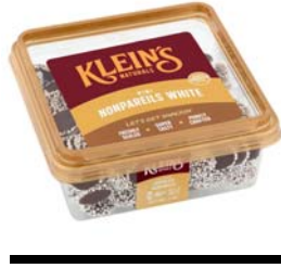
# 88215P Nonpareils Mini White Passover