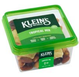
# 22800 Tropical Mix 6/7oz.