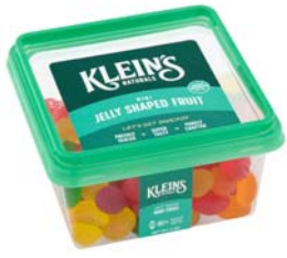
# 88301 Jelly Shaped Mini Fruit 6/8oz.