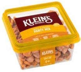
# 11504 Party Mix. 6/7oz.