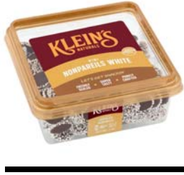
# 88215 Nonpareils Mini White 6/7oz.