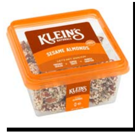
# 11104 Almonds Sesame 6/7oz.