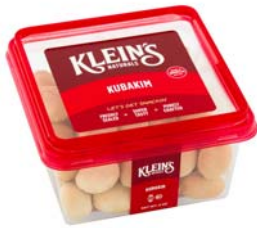
# 11511 Kubakim 6/5oz.