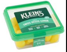
# 88324 Swiss Petite Fruits Lemon Flav