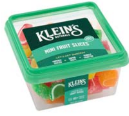
# 88314 Mini Fruit Slices 6/8oz.