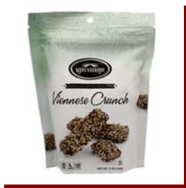
# 31991 Viennese Crunch 6/5 oz PARVE