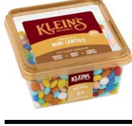
# 88221 Chocolate Mini Lentils 6/10oz.