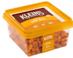
# 11521 Corn Nuts BBQ 6/5oz.