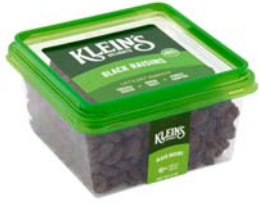
# 22115 Black Raisins 6/8oz.