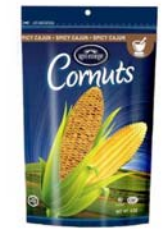
# 31824 Corn Nuts Spicy Cajun 12/6 oz