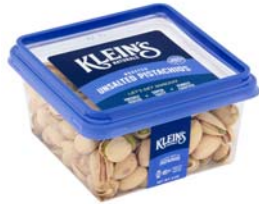
# 11201 Pistachios Roasted Unsalted 6/7oz.