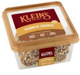
# 88202 Viennese Crunch 6/6oz.