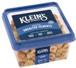
# 11901 Filberts Roasted Unsalted 6/7oz