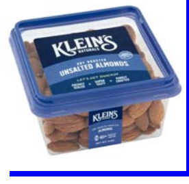
# 11121 Almonds Dry Roasted Unsalted 6