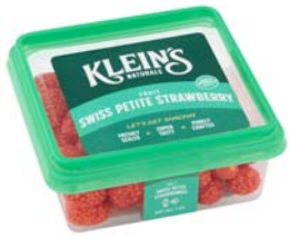
# 88325 Swiss Petite Fruits Strawberry