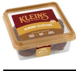
# 88204P Almond Clusters Passover 6/6oz