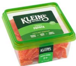
# 22103 Papaya Chunks 6/9oz.