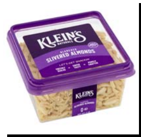
# 11125 Almonds Slivered Blanched 6/8o