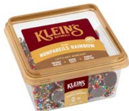
# 88200 Nonpareils Mini Rainbow 6/7oz.