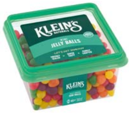
# 88300 Jelly Shaped Mini Balls 6/12oz