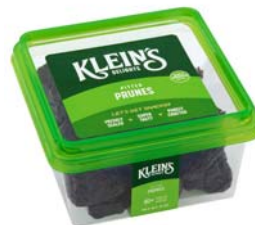
# 22105 Pitted Prunes 6/8oz.