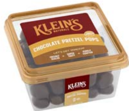
# 88005 Chocolate Pretzel Poppers 6/8oz.