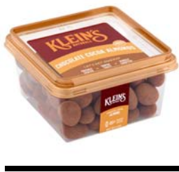
# 88212P Chocolate Cocoa Almonds Passov