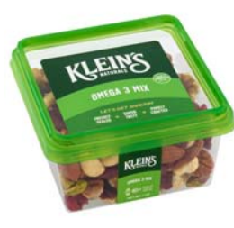
# 22820 Omega 3 Mix 6/7oz.