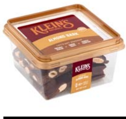
# 88203P Almond Bark Passover 6/6oz.