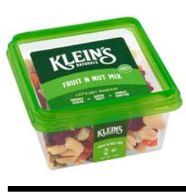
# 22890 Fruit N Nut Mix 6/7oz.