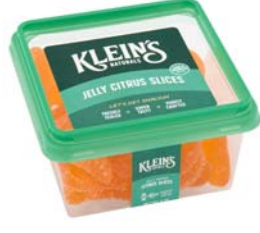
# 88310 Jelly Slices Citrus 6/8oz.