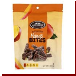
# 31987 Chocolate Mango Bites 6/5 oz PARVE