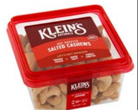
# 11304 Cashews Dry Roasted Salted 6/7oz.