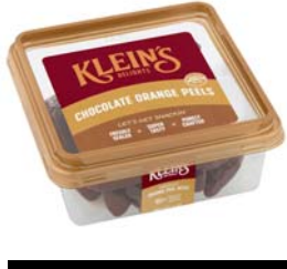
# 88206 Orange Peel. Chocolate 6/4oz.