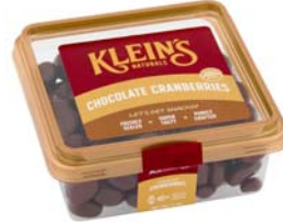
# 88001 Chocolate Cranberries 6/8oz.