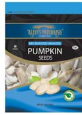
# 31803 Pumpkin Seeds Dry Roasted Unsa