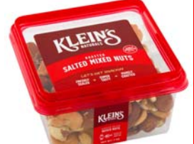
# 11502 Mixed Nuts Roasted Salted 6/7oz.