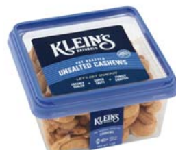
# 11303 Cashews Dry Roasted Unsalted 6/7oz.