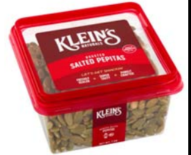
# 11509 Pepitas Roasted Salted 6/7oz.