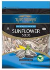
# 31802 Sunflower Seeds Dry Roasted Un