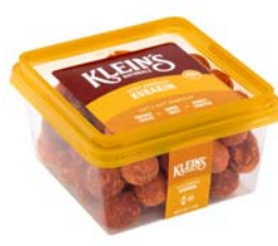
# 11512 Kubakim Spicy BBQ 6/7oz.