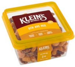
# 11503 5th Ave Mix 6/8oz.