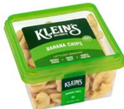
# 22104 Banana Chips 6/5oz.