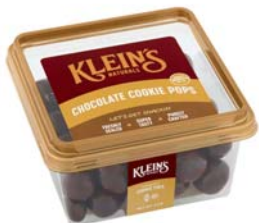
# 88007 Chocolate Cookie Pops 6/8oz.