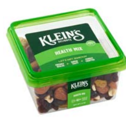
# 22860 Health Mix 6/8oz.