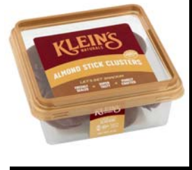
# 88205 Almond Stick Clusters 6/6oz.