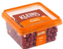
# 11404 Peanuts Sugar Toasted 6/7oz.