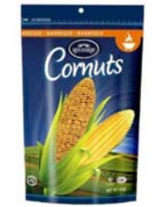
# 31821 Corn Nuts BBQ 12/6 oz