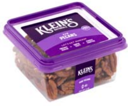
# 11800 Pecans Raw 6/6oz.