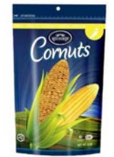
# 31823 Corn Nuts Ranch 12/6 oz