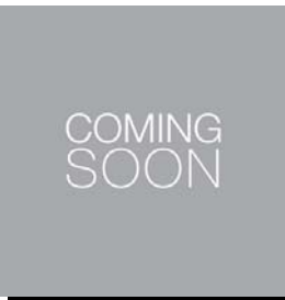
# 11616 Walnuts In Shell 16/16oz.