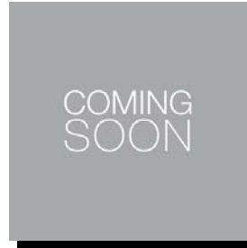
# 11116 Almonds In Shell 20/16oz.