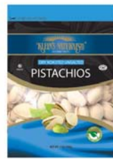
# 31807 Pistachios Dry Roasted Unsalte