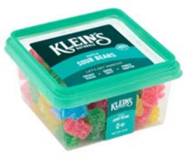
# 88312 Super Sour Bears 6/9oz.