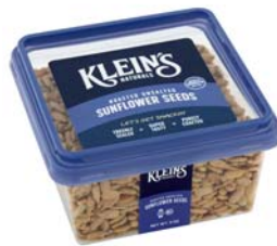
# 11741 Sunflower Seeds Hulled Roasted