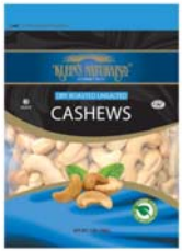
# 31811 Cashews Dry Roasted Unsalted 1