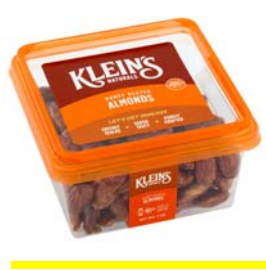
# 11103 Almonds Honey Glazed 6/7oz.