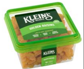
# 22114 Golden Raisins 6/8oz.