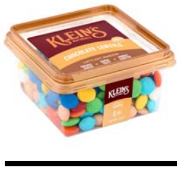
# 88220 Chocolate Lentils 6/10oz.