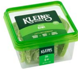
# 22101 Dried Kiwi 6/7oz.