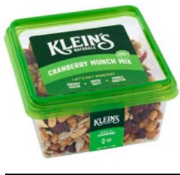
# 22870 Cranberry Munch Mix 6/7oz.