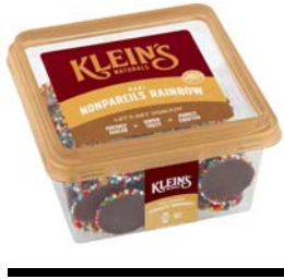
# 88201P Nonpareils Maxi Rainbow Passov