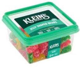
# 88309 Jelly Shaped Bears 6/8oz.