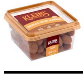
# 88212 Chocolate Cocoa Almonds 6/9oz.