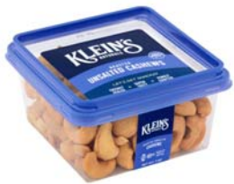
# 11301 Cashews Roasted Unsalted 6/7oz.