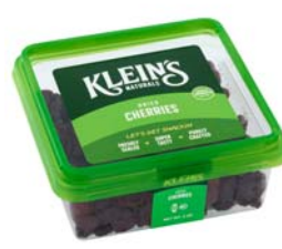
# 22113 Dried Cherries 6/5oz.