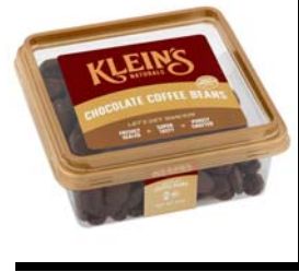
# 88214 Chocolate Coffee Beans 6/6oz.