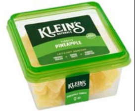
# 22102 Pineapple Tidbits 6/8oz.