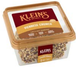
# 88202P Viennese Crunch Passover 6/6oz