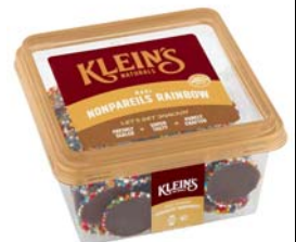
# 88201 Nonpareils Maxi Rainbow 6/7oz.