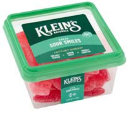
# 88313 Super Sour Smiles 6/9oz.