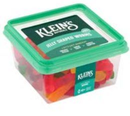
# 88308 Jelly Shaped Worms 6/8oz.