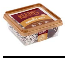
# 88216P Nonpareils Maxi White Passover