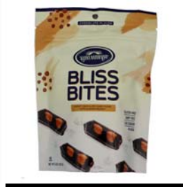
# 31992 Bliss Bites 6/5 oz PARVE