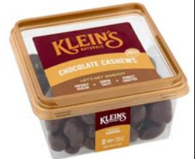
# 88006P Chocolate Cashews Passover 6/8