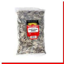
# 50756 Sunflower Seeds Roasted Salted PARVE