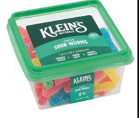
# 88311 Super Sour Worms 6/9oz.