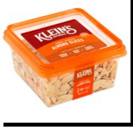
# 11107 Almonds. H/G Slices 6/6oz.