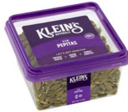
# 11508 Pepitas Raw 6/8oz.