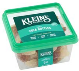
# 88305 Sour Cola Bottles 6/8oz.