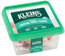
# 88322 Crystal Matlow Candy Fruit 6/5