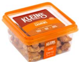
# 11305 Cashews Honey Glazed 6/6oz.