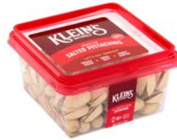
# 11202 Pistachios Roasted Salted 6/6oz.