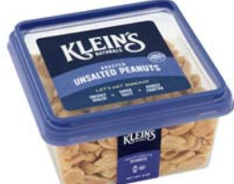
# 11401 Peanuts Roasted Unsalted 6/8oz.