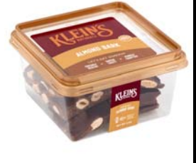
# 88203 Almond Bark 6/6oz.