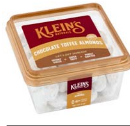
# 88213P Chocolate Toffee Almonds Passov