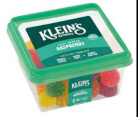
# 88303 Jelly Shaped Raspberry 6/8oz.