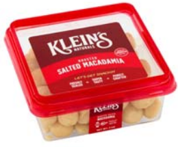
# 11505 Macadamia Roasted Salted 6/5oz