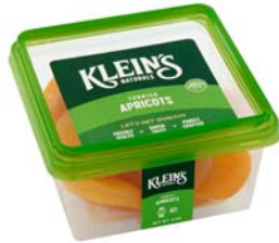
# 22100 Apricots Turkish 6/8oz.