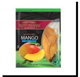
# C31942P Master Case Mango Passover 48/ PARVE