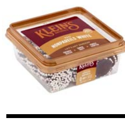
# 88216 Nonpareils Maxi White 6/7oz.