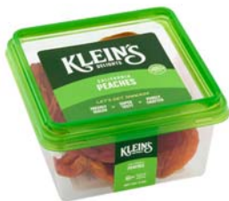
# 22111 Peaches California 6/6oz.